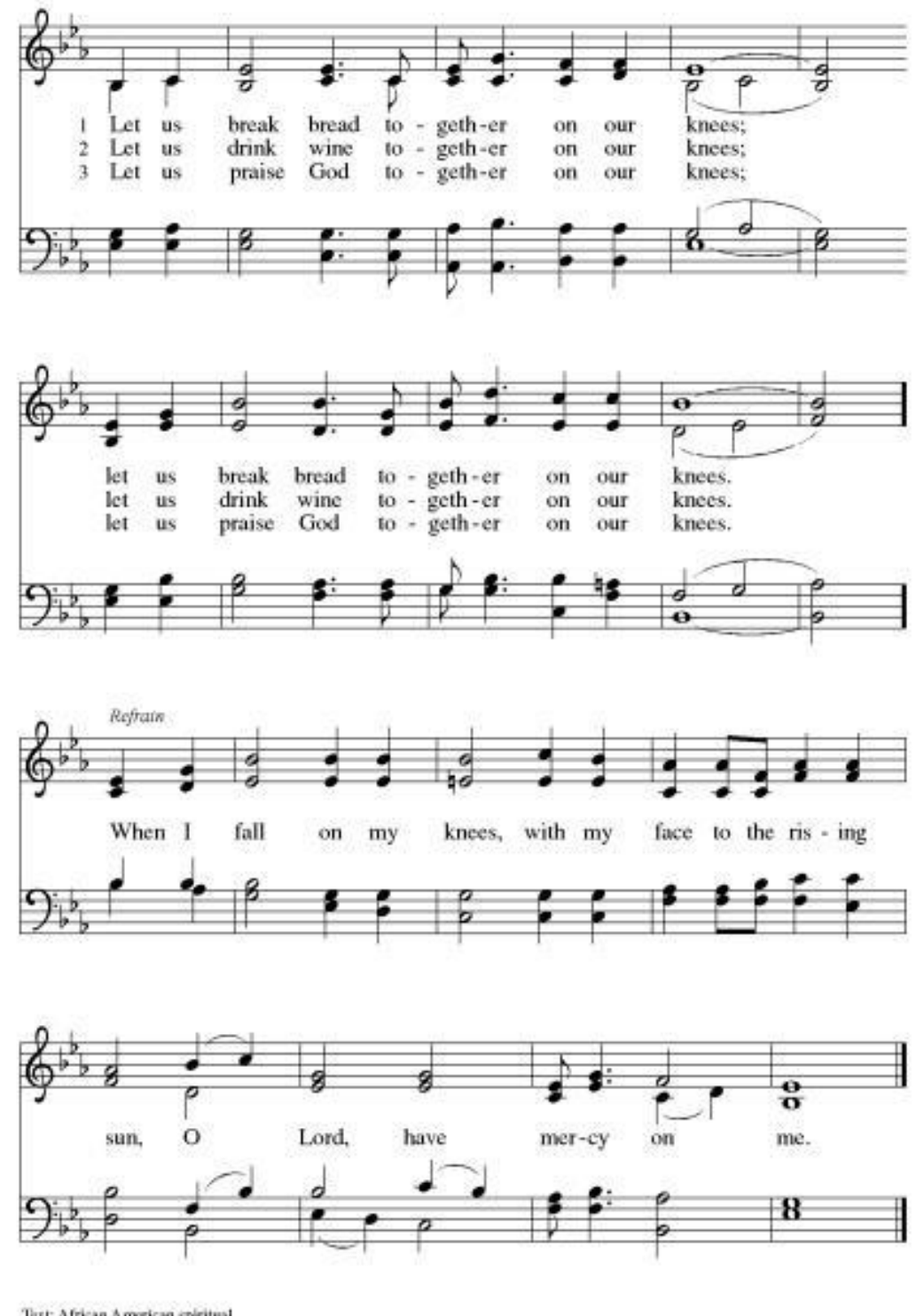
Let Us Break Bread Together

Test: African American spiritual Music: BREAK BREAD TOGETHER, African American spiritual